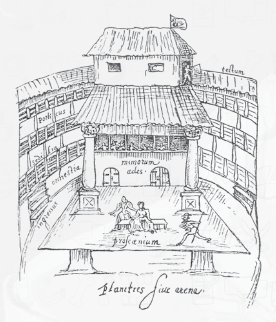
https://en.wikipedia.org/wiki/The Swan (theatre)