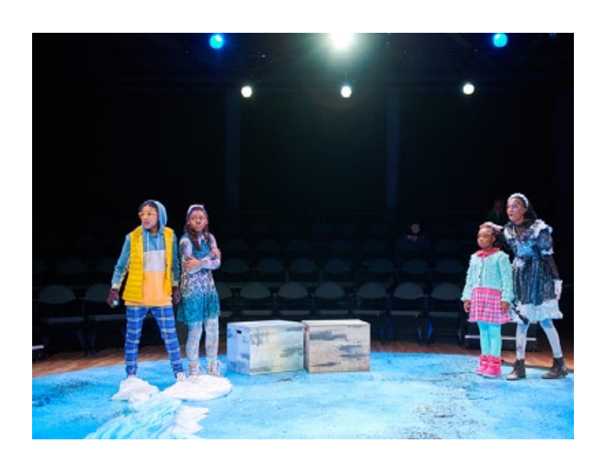
The stage is for the actors only.